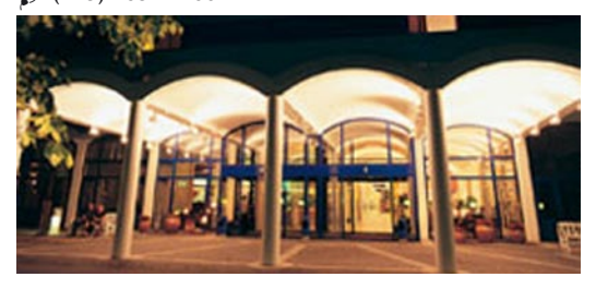
Wednesday 24<sup>th</sup> May 20.00

Skovbrynet 1 DK - Kolding Ø (+45) 7634 1100