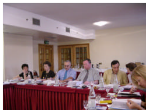
A 3-page photo report from the Porto conference on pages 5 – 7

Other countries represented were Austria (3), Bosnia/Herzegovina (1), Bulgaria (2), Croatia (4), Denmark (4), Slovakia (2), Spain (5), Greece (3), Hungary (4), Ireland (4), Italy (1), Yugoslavia (4), Norway (3), UK (2), Czech Rep. (1), Romania (6), Swiss (4), Russia (1) and Portugal (5).