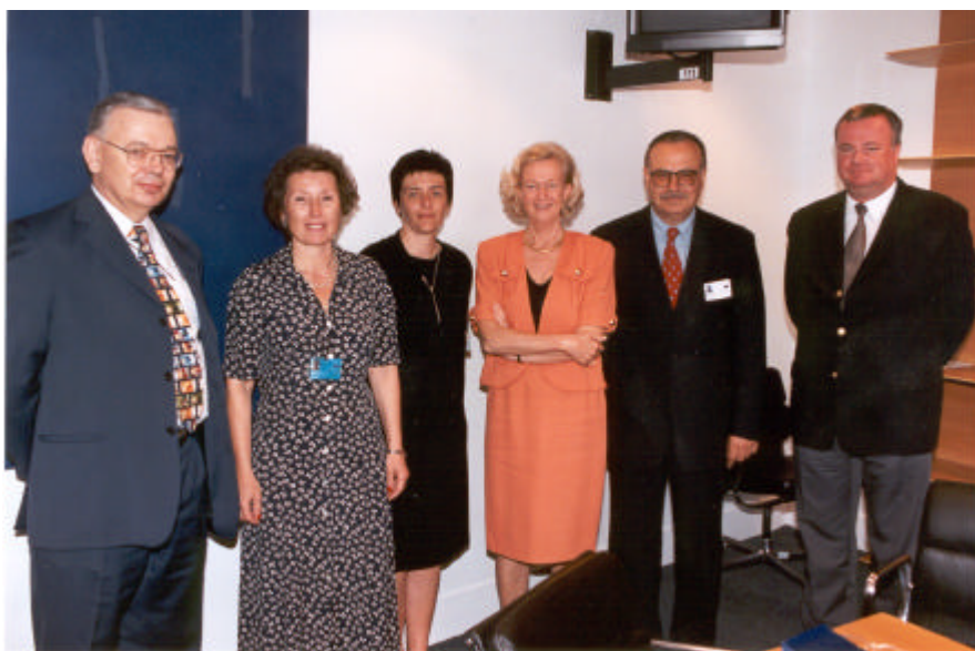
CR delegation to EP president Nicole Fontaine

CIRCOM Regional Newsmonthly • CR is the European Association of 380 Public Regional TV Stations in 38 countries • July 2001/No 21