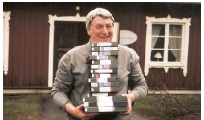
Chairman of the Judges